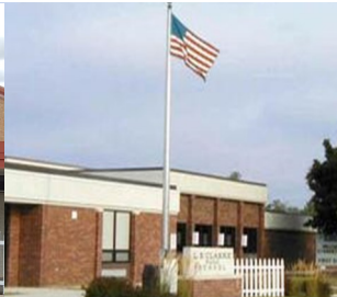
L.B. Clarke Middle School