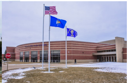
Two Rivers High School

Investing in the Future of Our Children & Community